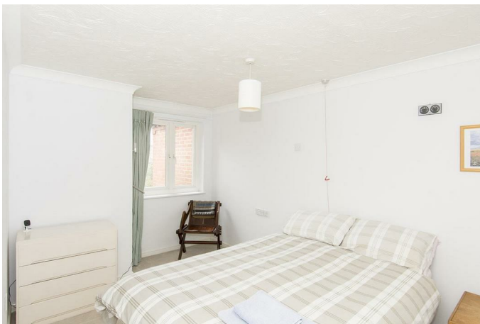
Bedroom 15'9" x 8'7" plus door recess (4.80m x 2.62m plus door recess)

UPVC double-glazed window. Electric storage heater. Mirrored wardrobes. Emergency pull cord.